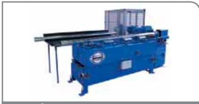
Spiro® Speed Carrier (SSC)