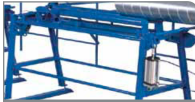
Standard Run-off Table

duct length up to 3m, including automatic discharge