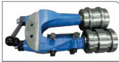
Standard Corrugation Unit

Produce ducts with smooth inside surface at the ends but reinforced with corrugation