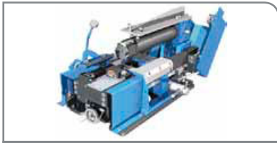
Slitter Model H

Standard unit with highest steel quality rollers