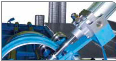
Automatic Corrugation Unit

User-friendly display featuring interface to network and internet, diagnosis tool and multilingual function