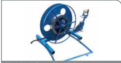
Vertical Decoiler DCV-1000

Standard decoiler with max. 1000 kg loading capacity