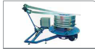
Horizontal Decoiler DCH-3000

duct length up to 3m, including automatic discharge