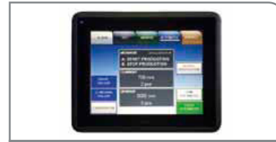
State-of-the-art User Interface

User-friendly display featuring interface to network and internet, diagnosis tool and multilingual function