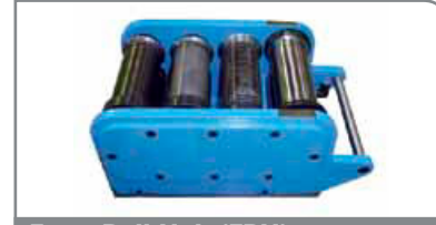
Form Roll Unit (FRU)

Standard unit with highest steel quality rollers